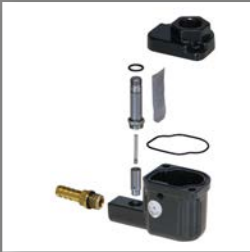
Easy to service