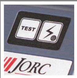
LED light & test button