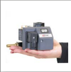
Small & lightweight